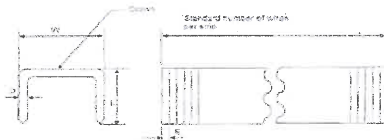
Figure 1 – Staples

Handwritten notes and signatures in blue ink, including initials and the number 9.